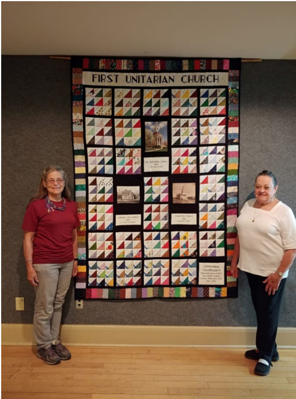
Church Anniversary Quilt