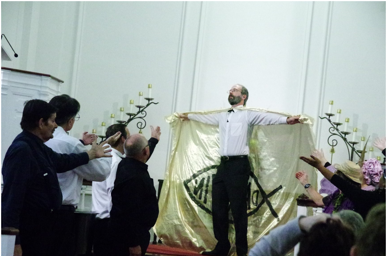
Revival of Newton Mann: Superstar show on August 24, 2019 A celebration of 150 years of First Unitarian Church of Omaha