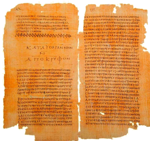
Gospel of Thomas manuscript from Codex II of Nag Hammadi Library